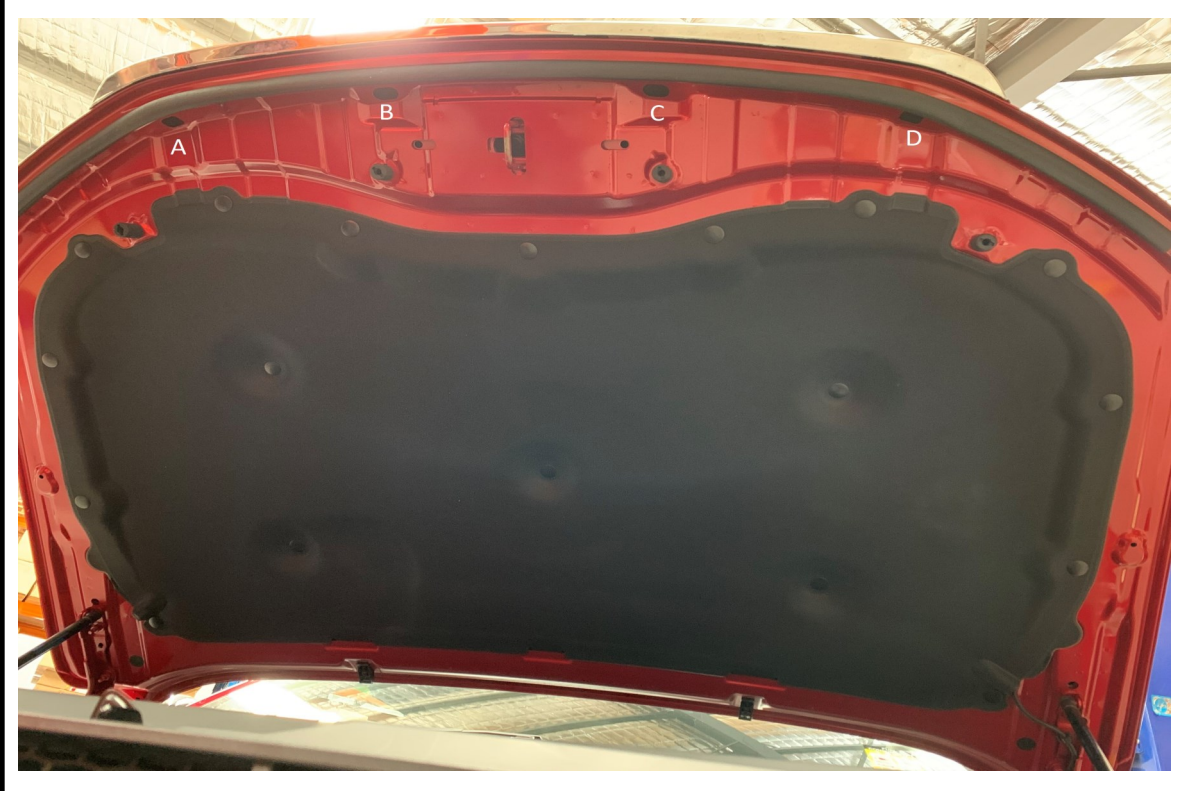
Access Points (A, B, C & D) for Chrome Cladding